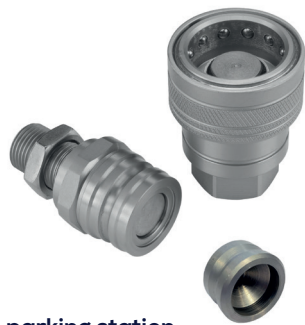
parking station for female body